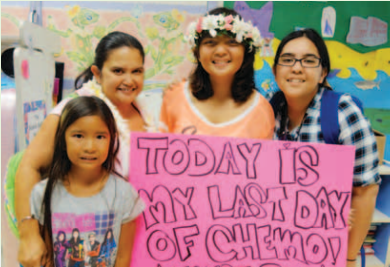
The Baliguat-Lamoya Family